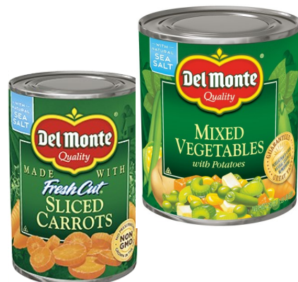
Canned Carrots and Mixed Vegetables