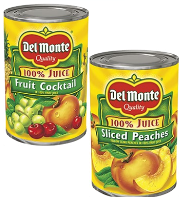
Canned Fruit in 100% Juice

We provide groceries based on USDA Guidelines for a Healthy Diet to all of our pantries and programs. Please help us provide the healthiest food possible to those in need by donating these Most Needed Items :