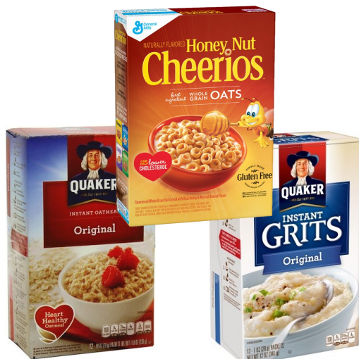
Breakfast Items (oatmeal, cereal, grits)