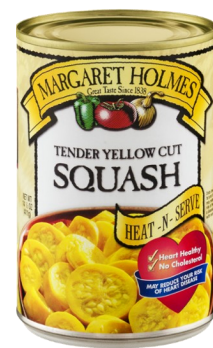
Canned Yellow Vegetables