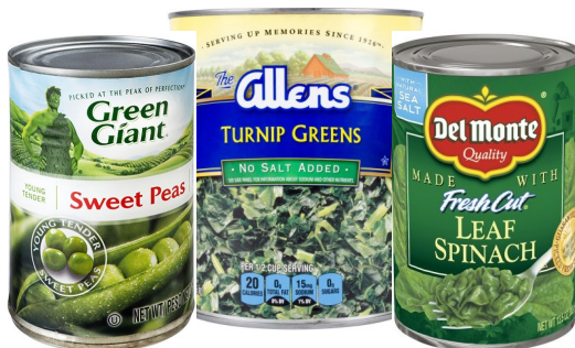
Canned Green Vegetables (peas, spinach, turnip greens)